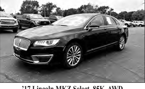
'17 Lincoln MKZ Select, 85K, AWD $19,900