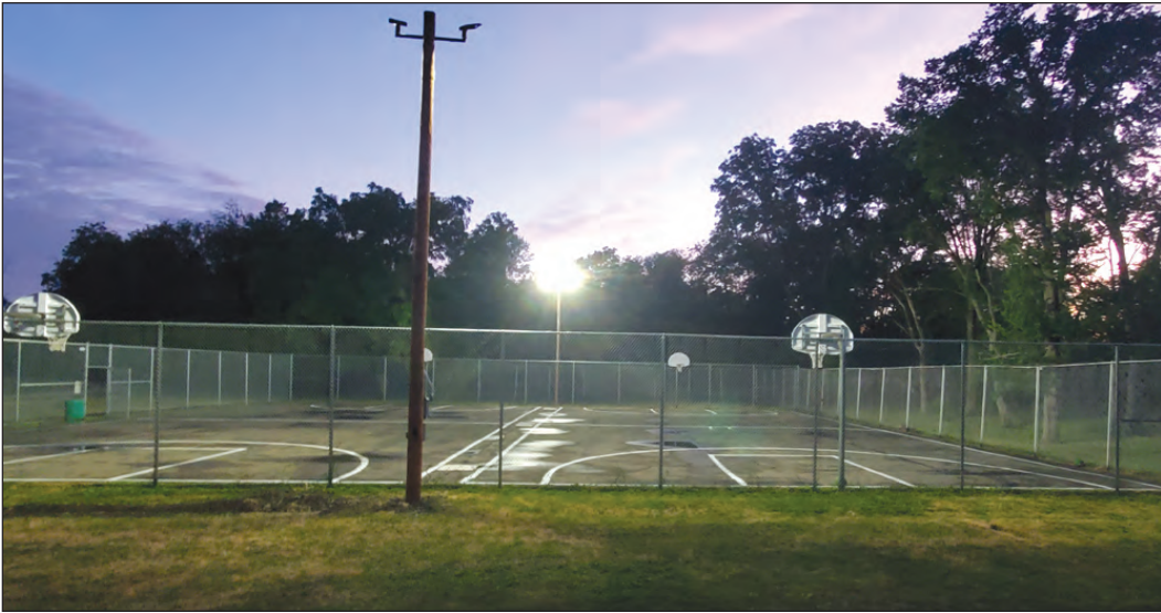
DWIGHT TOWNSHIP HIGH SCHOOL'S FACILITIES will look a little different for this upcoming school year. The "Crow's Nest" Trojans football team's press box is under renovation, lights have been added to the outdoor basketball courts, and the Bill Gilkey Memorial Wall will be reinstated.

"We did lock the basketball courts for a week because there was broken glass prior to putting the lights up. That's some-