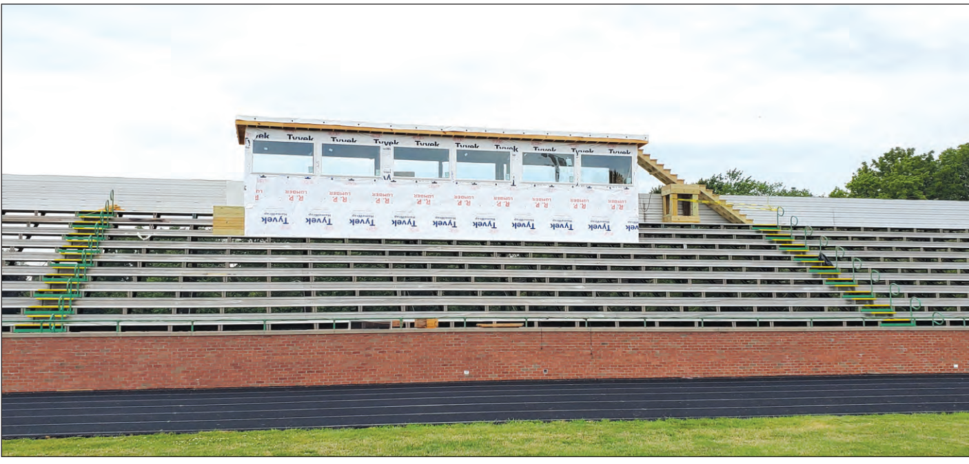
CROW'S NEST at Dwight Township High School has taken on a new look this year. A matchable grant up to $100,000 - whatever the school pays into the project, the value will be matched.