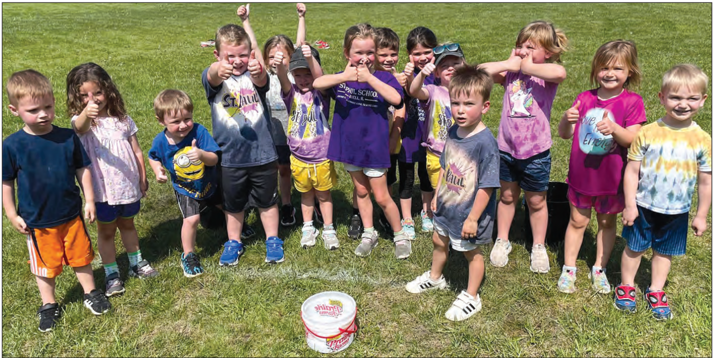
ST. PAUL SCHOOL pre-school students invite you to enroll at St. Paul School, Odell. Beginning in the 2022-23 school year, any child enrolled in St. Paul's pre-school program will be able to stay for the school's after care program at no additional cost.