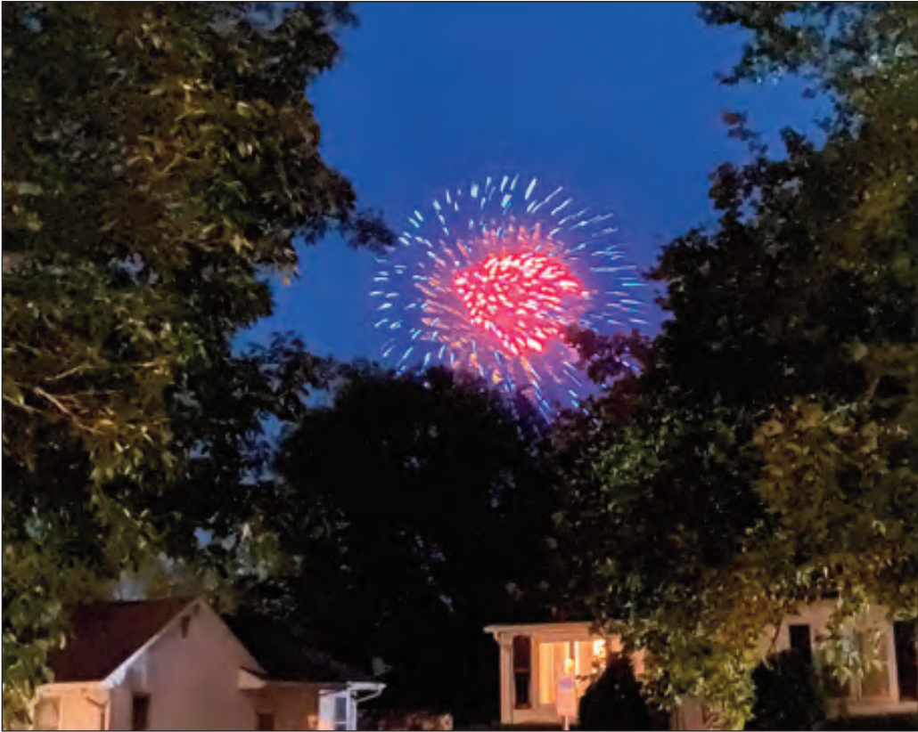
BANG UP JOB, DWIGHT! The 4th of July turned into the 9th of July due to weather but the fireworks were equally as loud :) and satisfying to the audience.