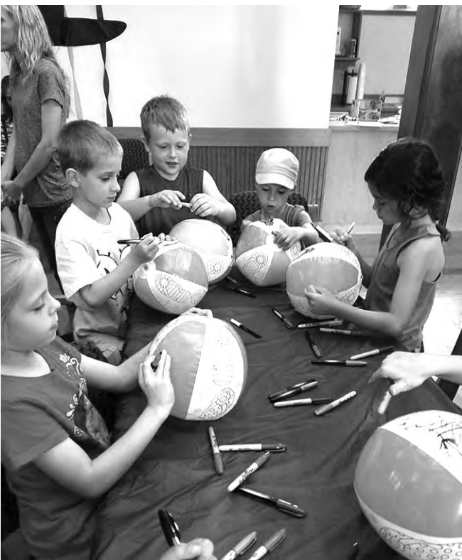
THE SUMMER PROGRAM at Prairie Creek Library in Dwight is “Dive into Reading”. Toddlers, school-age children and adults are enjoying summer learning and reading at the library located at 501 Carriage House Lane, Dwight.