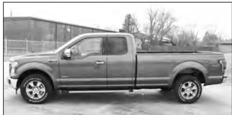
'17 F150 S/C Lariat, 100 Miles, 4WD, 8' Bed $42,900