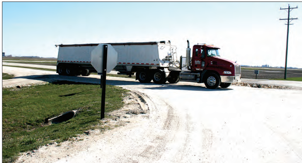
SEMI-TRACTOR trailer traffic, driven by area farmers, enters and exits Route 17 where Consolidated Grain and Barge is located, just east of Dwight. Livingston County and State Police are beefing up patrols to increase safety along the state route.

"Drivers should be on the lookout for implement vehicles as well as semi-tractor trailers."