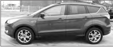
'14 Escape SE, 55K, 4WD $14,900