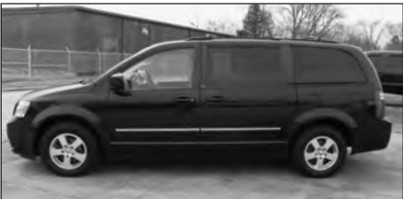
'10 Grand Caravan SXT, 137K $7,900