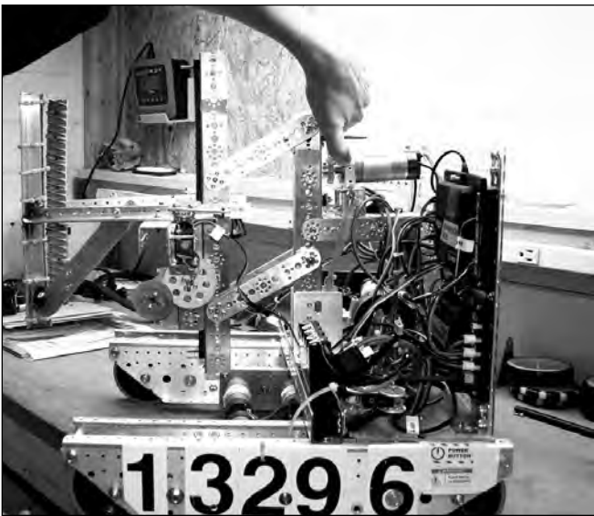
TONY THE TI-GEAR is the robot designed and built by Herscher High School students to compete in the First Tech Challenge tournaments this school year. It has color sensors and can pick up and stack objects.