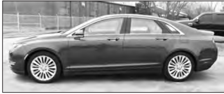
'14 MKZ, 24K $19,900