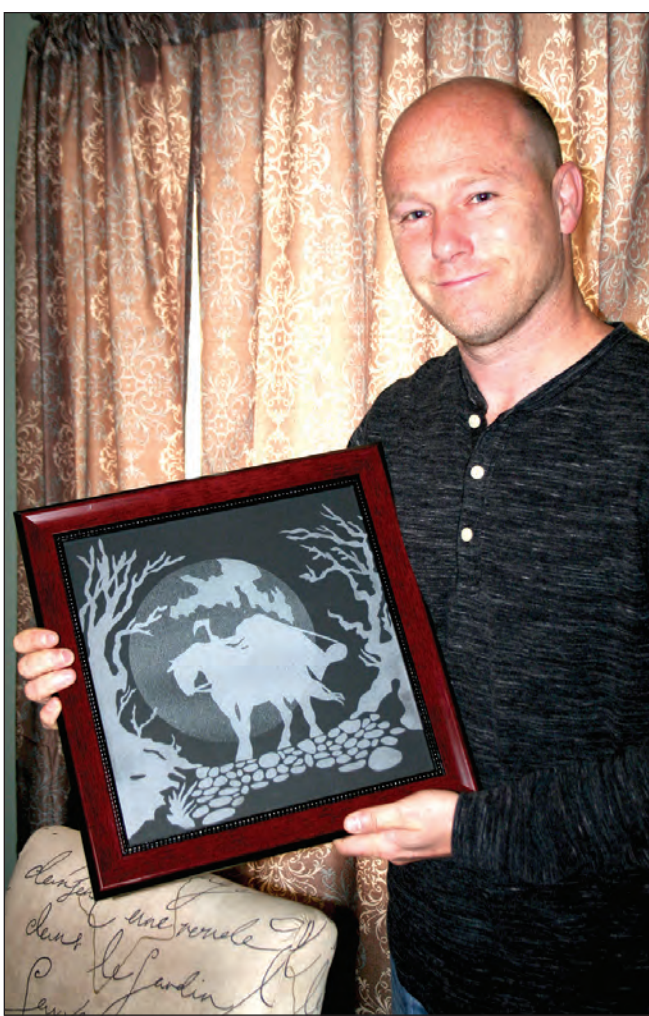
AFTER SANDBLASTING, and removing the paper, an image appears on the glass that is clear for the negative space and etched for the desired art. In the case of this “headless horseman” for Halloween, he etched the moon on the opposite side of the glass.