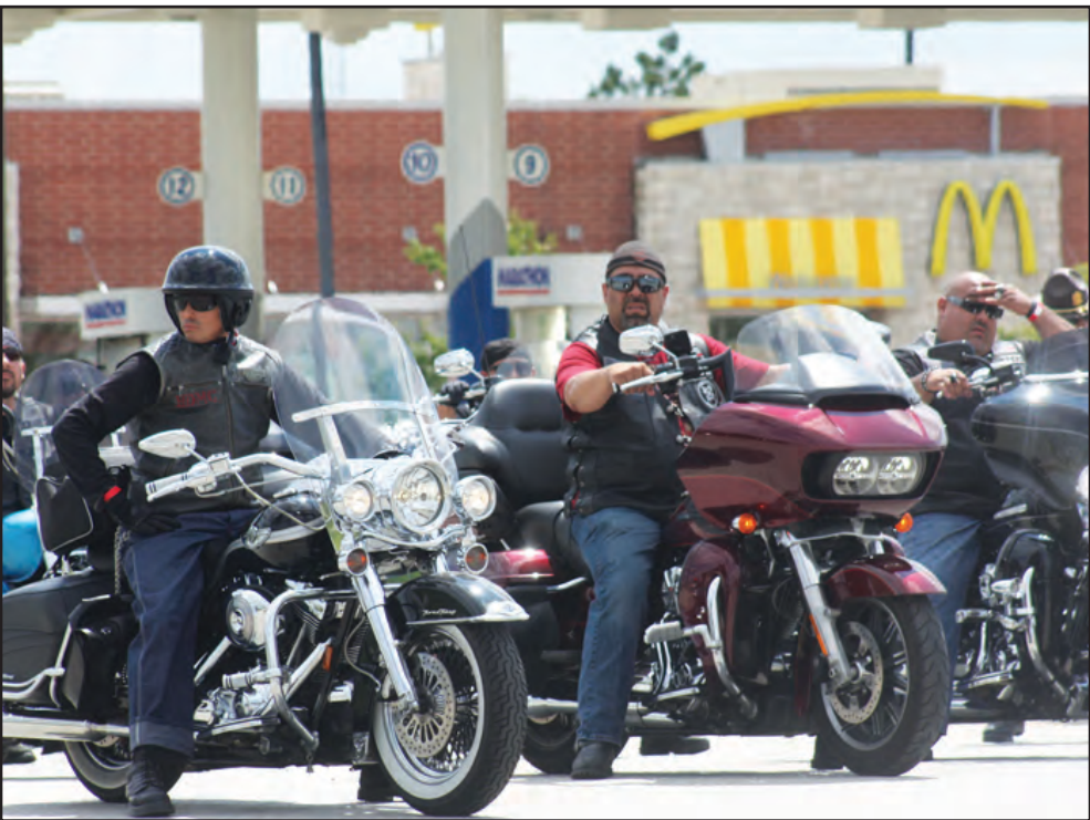
THE ILLINOIS State Police Heritage Foundation Illinois State Police Memorial Park Motorcycle and Fun Car run stopped by Dwight along Route 66 in Dwight on July 15. For more photos and details, see page 3.