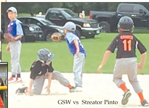
GSW vs Streator Pinto