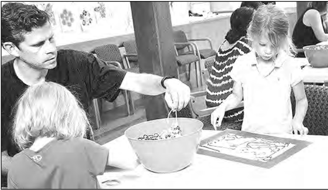
Local kids and adults enjoyed many programs that Prairie Creek Library in Dwight offered this summer during the Summer Reading Program, including Teddy Bear Day of Design, the IT Guy and Yarn Painting.