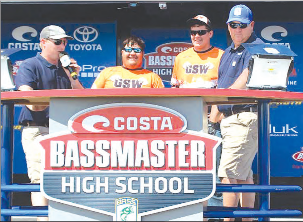
THE GSW FISHING TEAM qualified at the 2016 High School Bassmaster Open, competing against teams from Alabama, Arkansas, Indiana, Michigan, Wisconsin, Kentucky, Missouri, and Illinois.