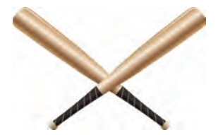
Below, Jimmy Harkenrider battles at the plate.