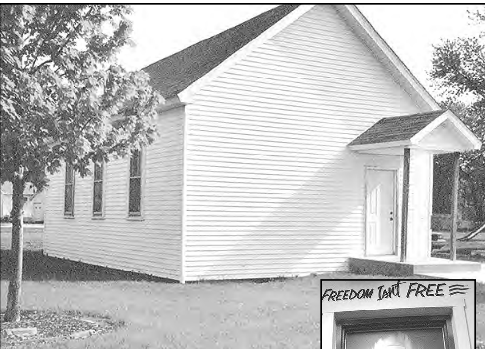
The Brown School, sometimes called the Wooduff School, was built in 1897. It stood at the southwest corner of Section 5 in Essex Township. By 1948, like many other country schools with small enrollment, it was closed. It served as a primary classroom in what eventually became a four room school. A number of Essex residents attended the one-room school.