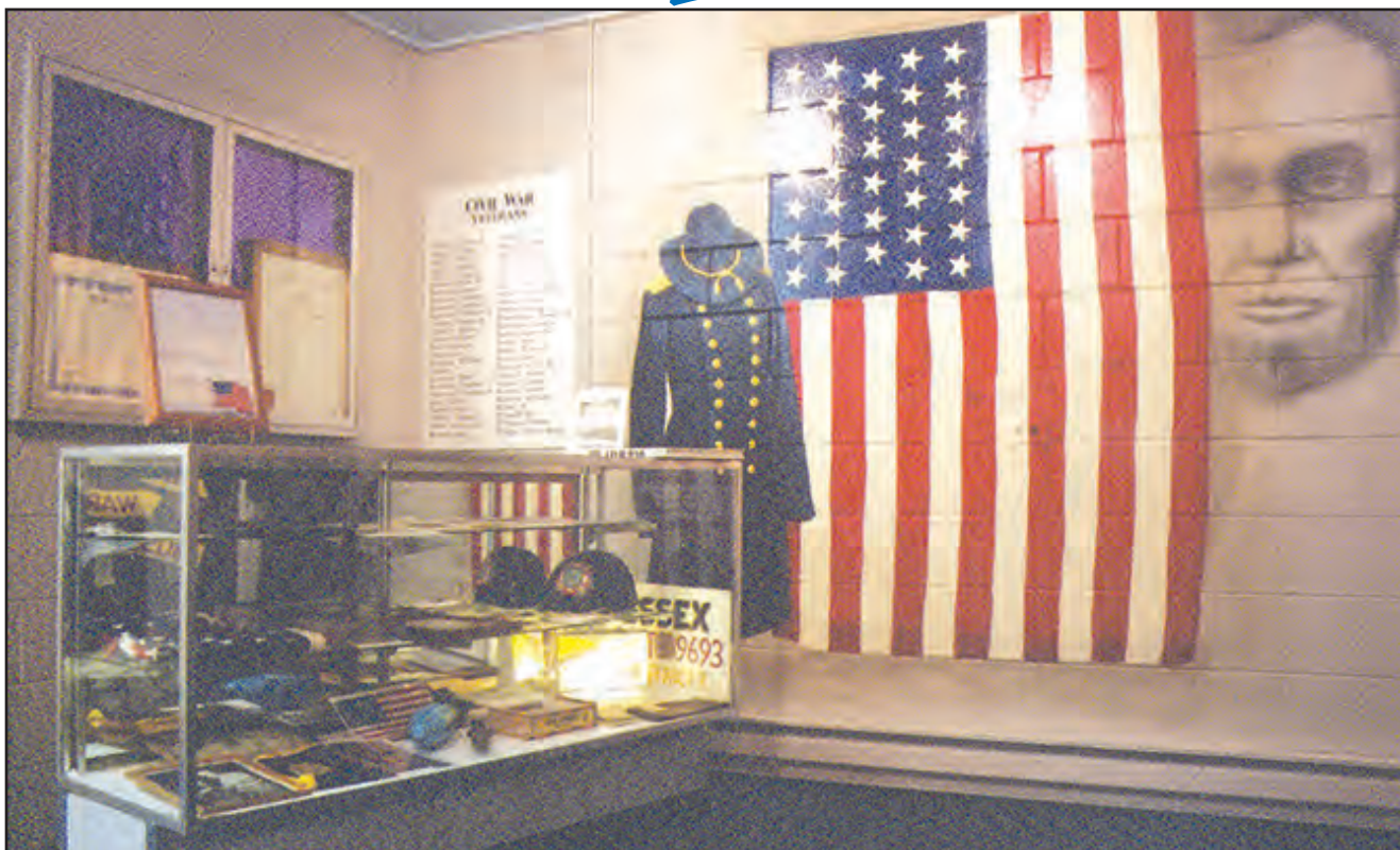
THE CIVIL WAR ROOM in the Essex Historical Society Museum includes memorabilia from the Civil War through current overseas conflicts. The Essex Historical Society is marking its 25th anniversary Sunday, June 26 with an Open House from 9 a.m. to 1 p.m.

The Dwight Historical Society Museum is open the second and fourth Saturdays of each month from 10:00 a.m. to 1:00 p.m., or by appointment.