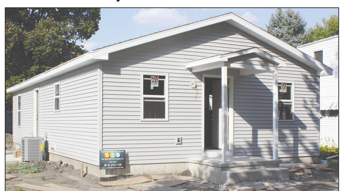
Habitat for Humanity home in Dwight.