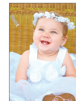
5th Place - Camry