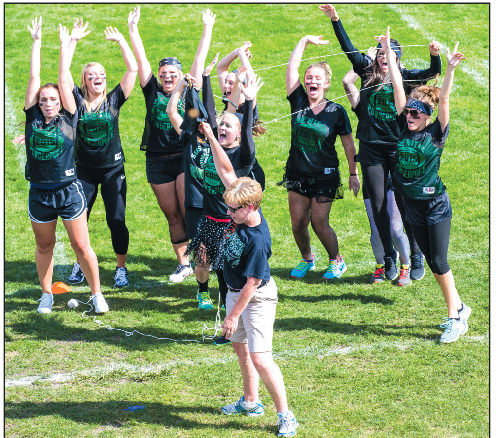
SCHOOL SPIRIT WAS ALIVE AND KICKING last week during the 2014 homecoming festivities. Many events were held throughout the week including the Trojan Games, Penny-Wars, and the Parade placing class against class to bring home the title of most spirited Trojan Class. The week was brought to an end with the crowning of new royalty and an evening of dancing the night away the night after the big game.