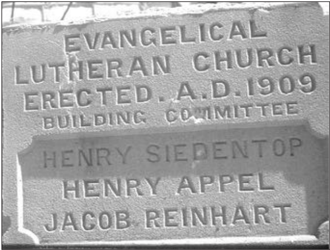
THE ORIGINAL CORNERSTONE of Trinity Lutheran Church in Herscher was laid on July 11, 1909.

several activities for children, including two bounce houses, face painting and tattoos, and a sidewalk chalk contest.