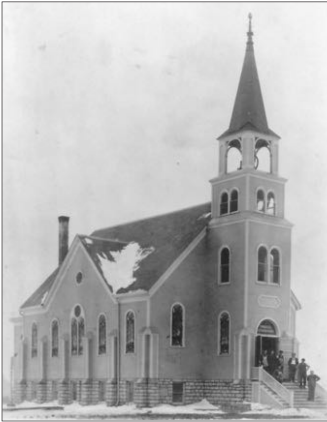
Trinity Lutheran marks 100 years. This is a photo of the original structure.