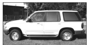
'96 Explorer XLT 126K, 4WD $3,900

301 SOUTH LADD ST. • PONTIAC, ILLINOIS 61764 • 815-844-3138 • WWW.FRAHERAUTOS.COM