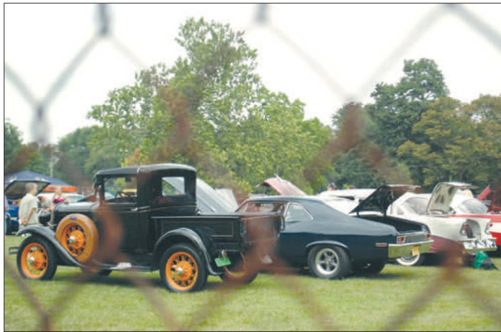
CLASSIC CARS filled the lawn of Dwight's Renfrew Park on Saturday, July 11, for the Team Taylor Classic Car Show. The show was held as a benefit to raise money for pediatric brain tumor research.