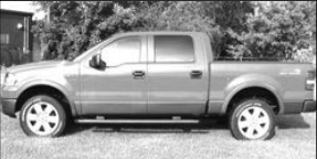
'07 F150 Crew FX4 6K, 4WD, Really Sharp Truck! Just In!