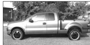
'05 F150 S/C XLT 37K, 2WD $14,900