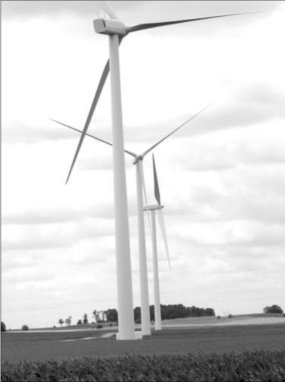
Progress is trucking right along on the Streater Cayuga Ridge Wind Farm South between Odell and Emington. As of July 6, 46 complete turbines have been delivered. About 64 percent of the roads to all 150 sites have been completed. Foundations to 83 wind turbines have been excavated, with 51 of those foundations entirely complete.