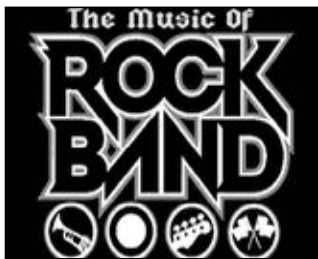
The 2009 Marching Trojans show logo