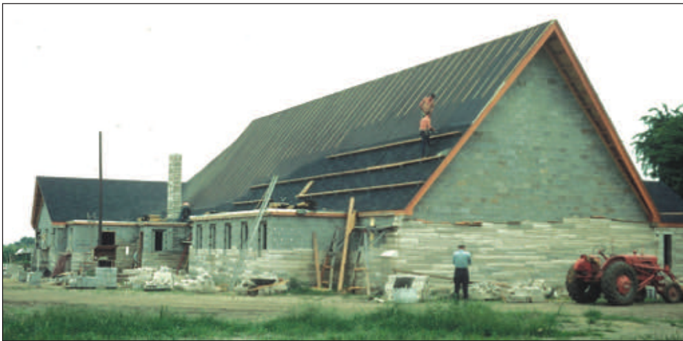
THIS IS THE PRESENT CHURCH being built in 1958.

The original cornerstone from 1909 was saved and put behind the church out of (continued on page 20)